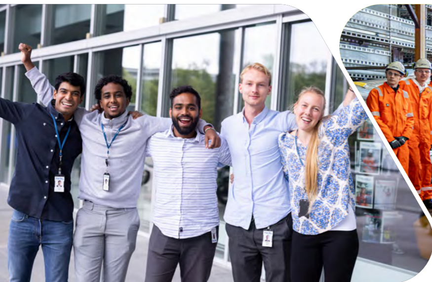
Aibel hired a total of 94 graduates in 2023.

Wage differences between genders are monitored and are insignificant for comparable positions and levels. We have focused on and will continue to monitor internal differences. We also monitor our attrition rate for employees leaving for a higher salary in other companies within our industry.