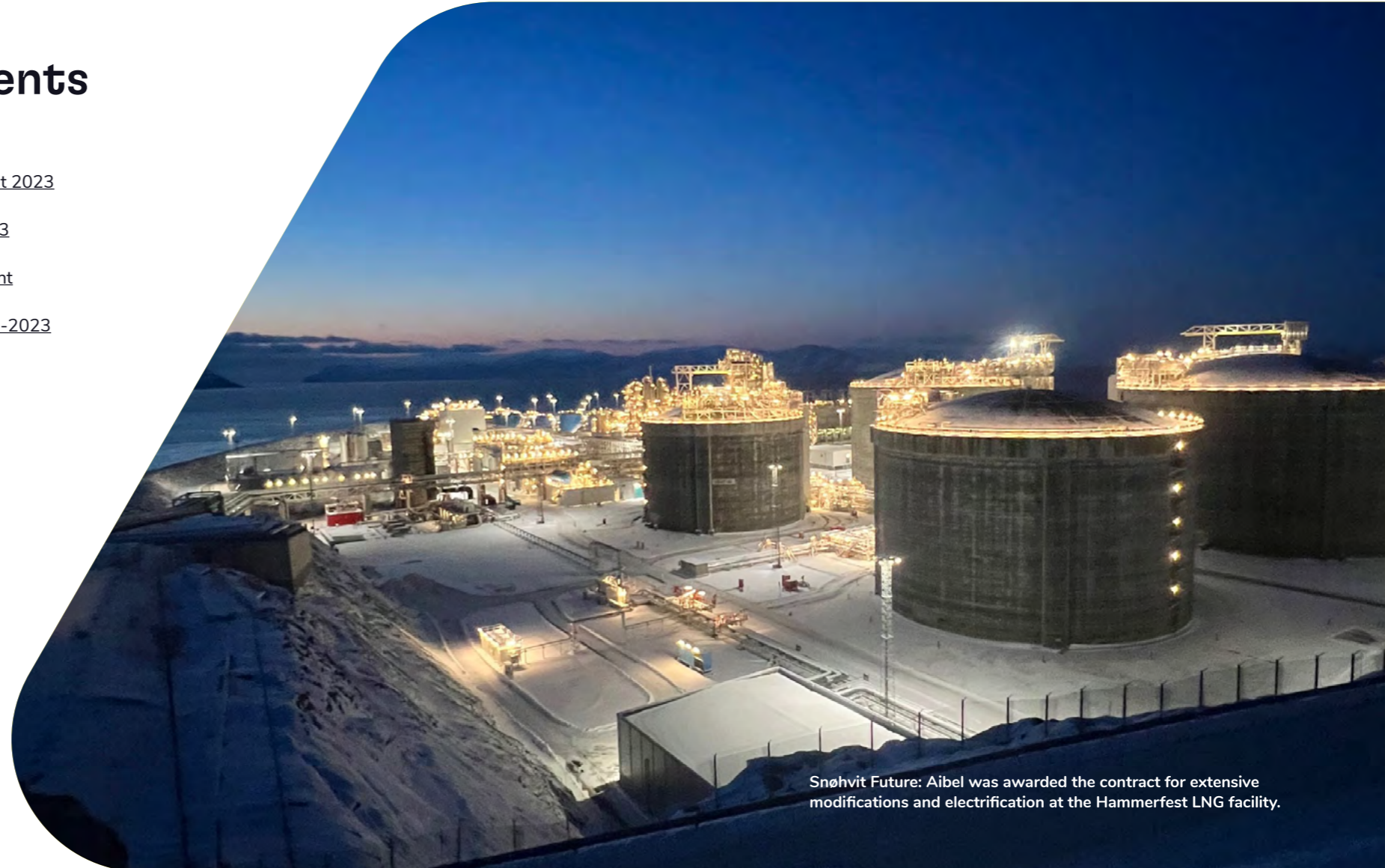
Snøhvit Future: Aibel was awarded the contract for extensive modifications and electrification at the Hammerfest LNG facility.