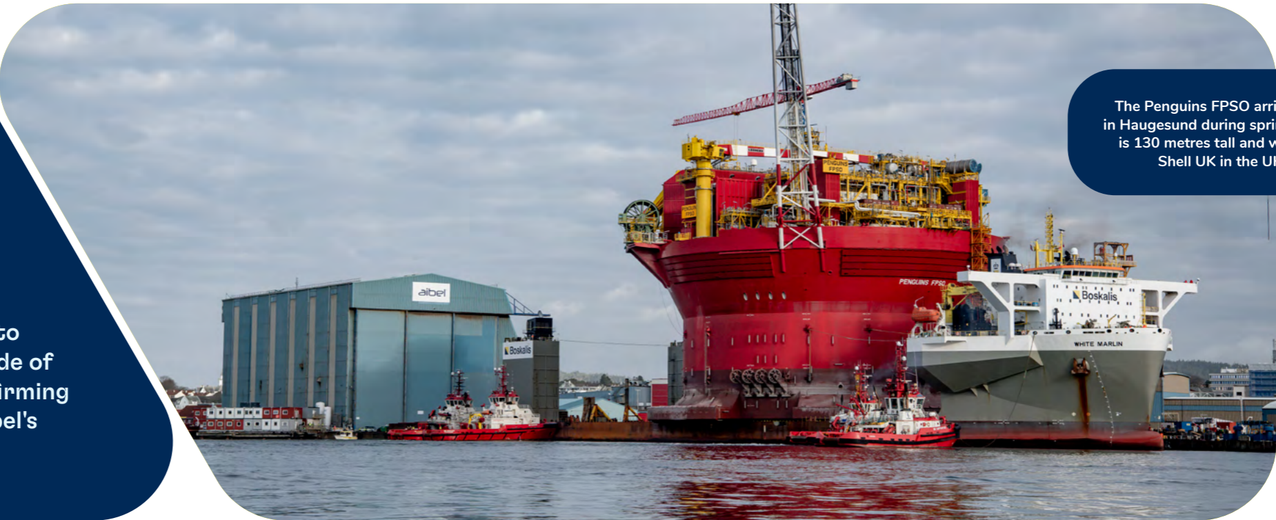
The Penguins FPSO arrived at Aibel's yard in Haugesund during spring 2023. The facility is 130 metres tall and will be operated by Shell UK in the UK North Sea.

To qualify as a supplier, companies are required to endorse the Supplier Code of Conduct declaration, affirming their commitment to Aibel's established principles.