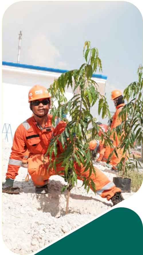
Around 65 volunteers from Aibel joined the annual tree planting event in Thailand.