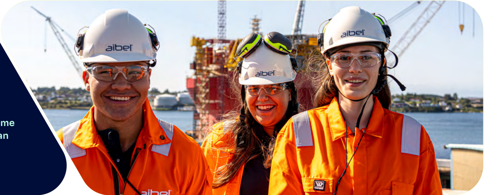
Every year Aibel takes on 50 new apprentices. These three are among the ones that had their first working day in September at the yard in Haugesund.

"Over the past six years, Aibel has become the largest Norwegian exporter of offshore wind solutions."