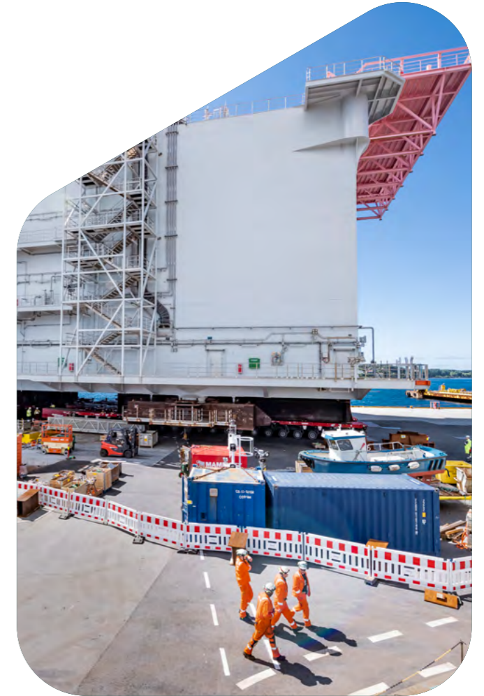
The wind converter platform Dogger Bank A before sail away from Aibel's yard in Haugesund in 2023. The first of three platforms Aibel is building for the Dogger Bank offshore wind farm.

Aibel reports on emissions in accordance with the Greenhouse Gas (GHG) Protocol and uses a combination